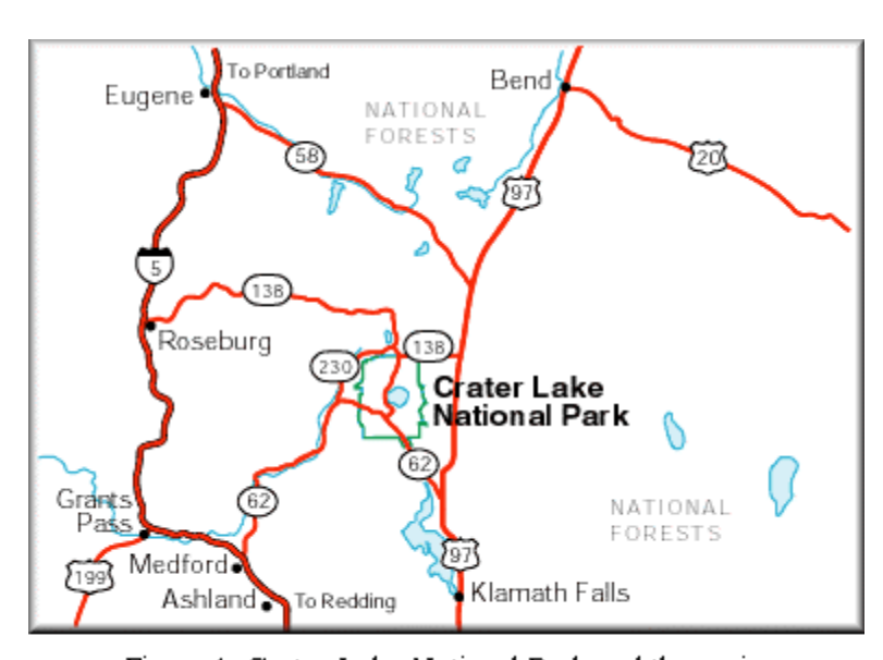
Figure 1. Crater Lake National Park and the region

Crater Lake National Park was created in 1902 to protect the volcanic lake, created by the eruption and collapse of Mt. Mazama around 7,000 years ago in south central Oregon. The park offers year-round recreation activities. Around two thirds of its summer visitors come from others states, mainly California and Washington (Visitor Service Project, 2001). Three gateway communities, Roseburg, Klamath and Medford, are about an hour driving distance away. The park is also about an hour driving distance to Interstate Highway 5 where it connects to Washington and California.