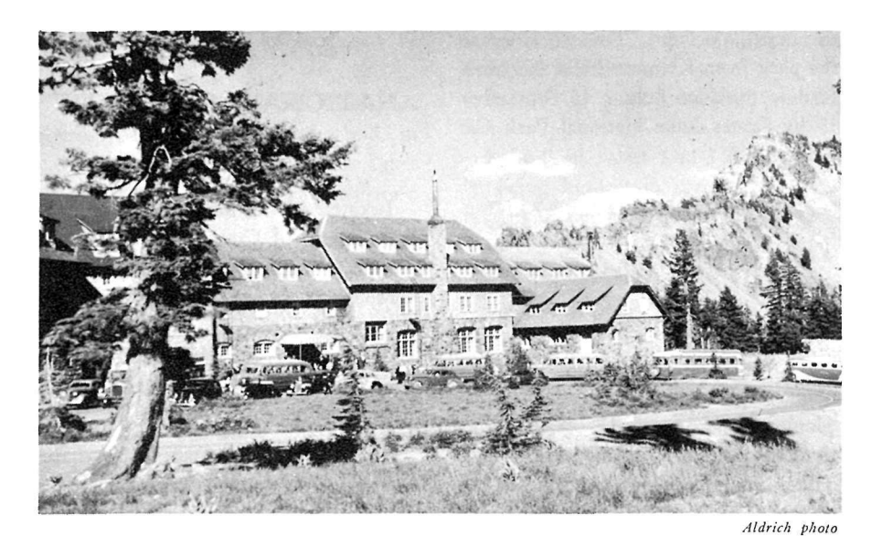
CRATER LAKE LODGE

One of the popular attractions is a launch trip around the lake, leaving the boat landing at 9 o'clock each morning during the travel season. A rangernaturalist describes to the launch passengers the points of scenic and scientific interest. The trip has been carefully planned and is available at the cost of $2 per person.