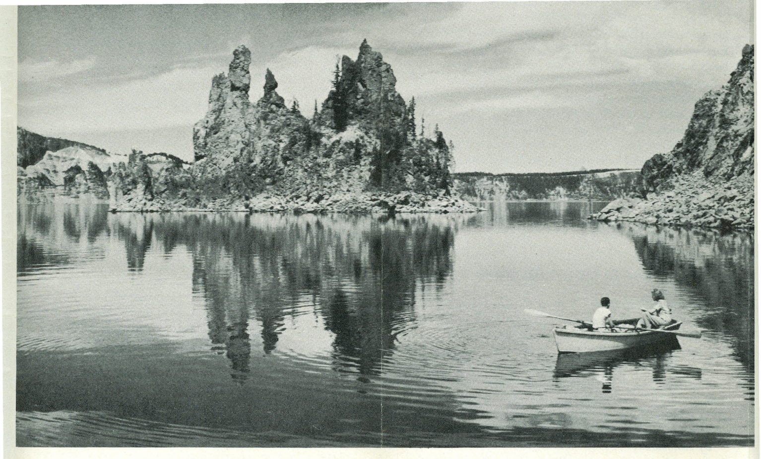
The Phantom Ship.

have been noted along the eastern side of the park. Other animals are the cougar, or mountain lion, the coyote, and the red fox. About 60 species of mammals are found in the park.